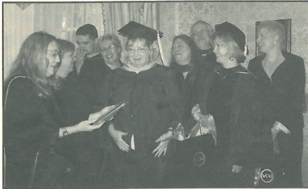
above: VCU Department of Gerontology Spring 2004 Graduation