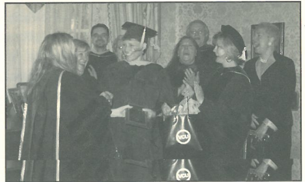
above: VCU Department of Gerontology Spring 2004 Graduation