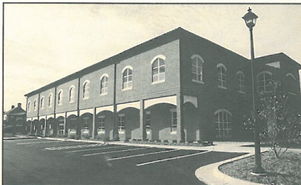
above: JABA's Senior Center and the Greene County Branch of the Jefferson-Madison Regional Library occupy the first floor of this new county-owned building in Standardville.

Below are a few pictures of the facility and the participating seniors.