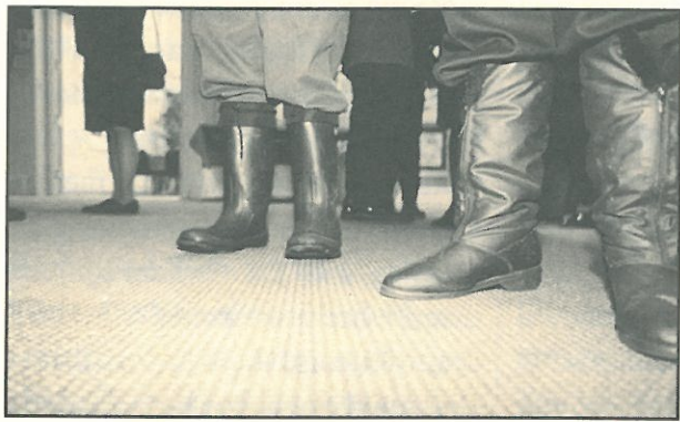
above: Prepared for the weather!

Every year in order to update the General Assembly on the progress it is making in meeting its mission through primary study, research, and information and