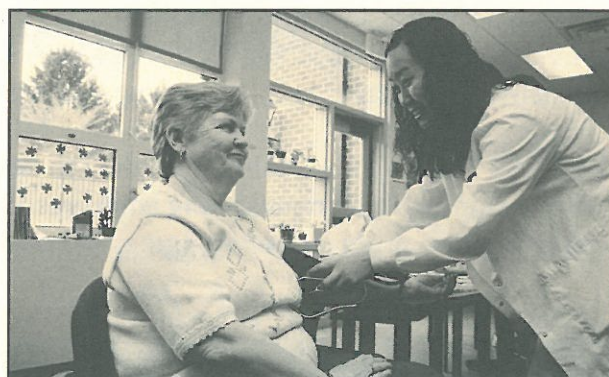
above: Funding from the Virginia Healthcare Foundation helps University of Virginia nursing students assist with health monitoring for JABA's Greene County seniors.