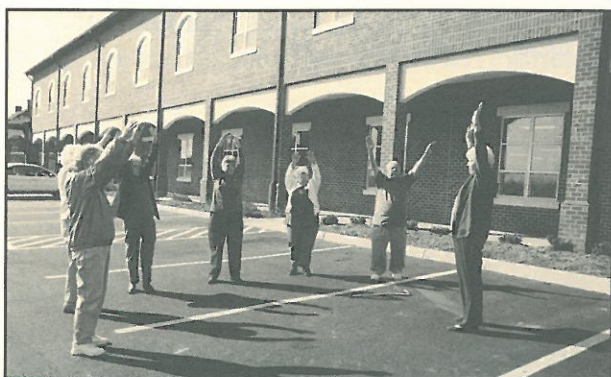
above: Greene County seniors reach for the sky during exercise class.