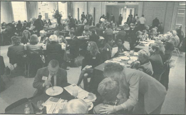
above: Participants enjoy VCoA's southern-style breakfast.