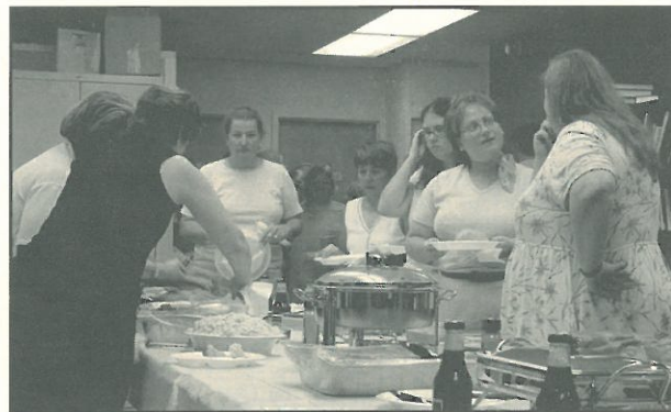
Enhanced Care Assistant Training Graduates August 2003