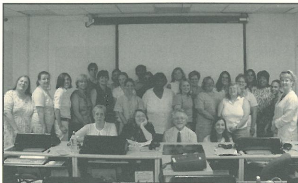
VCU Department of Gerontology New Student Orientation August 2003