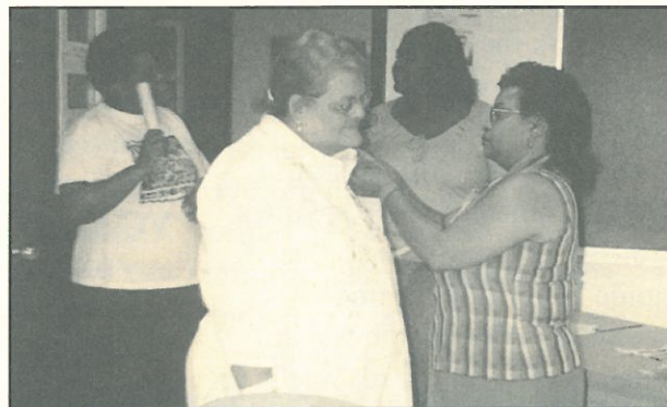
VCU Health Careers Expo October 2003