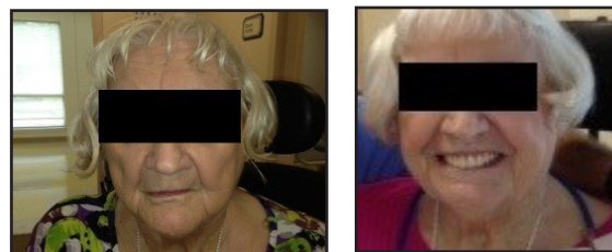
Before dentures (left) and after dentures (right).